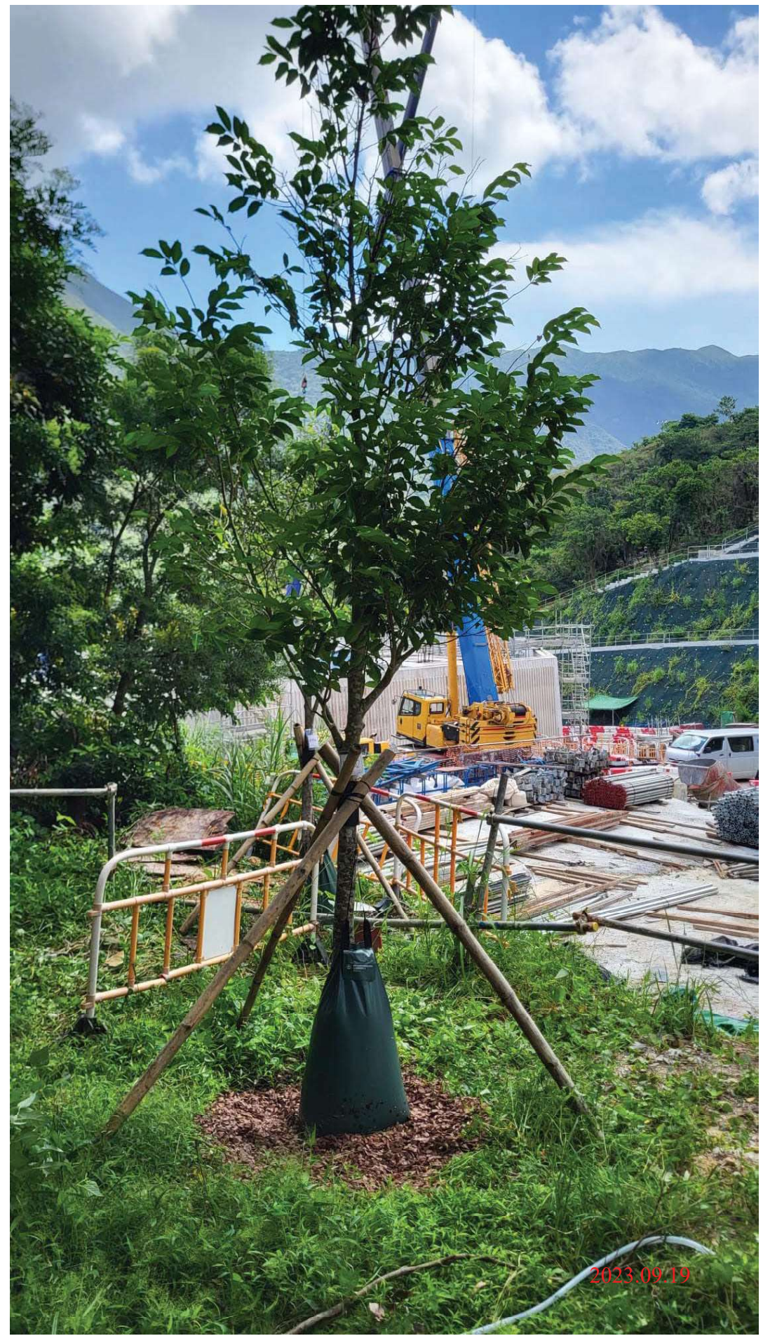
RP02-Whole view of tree