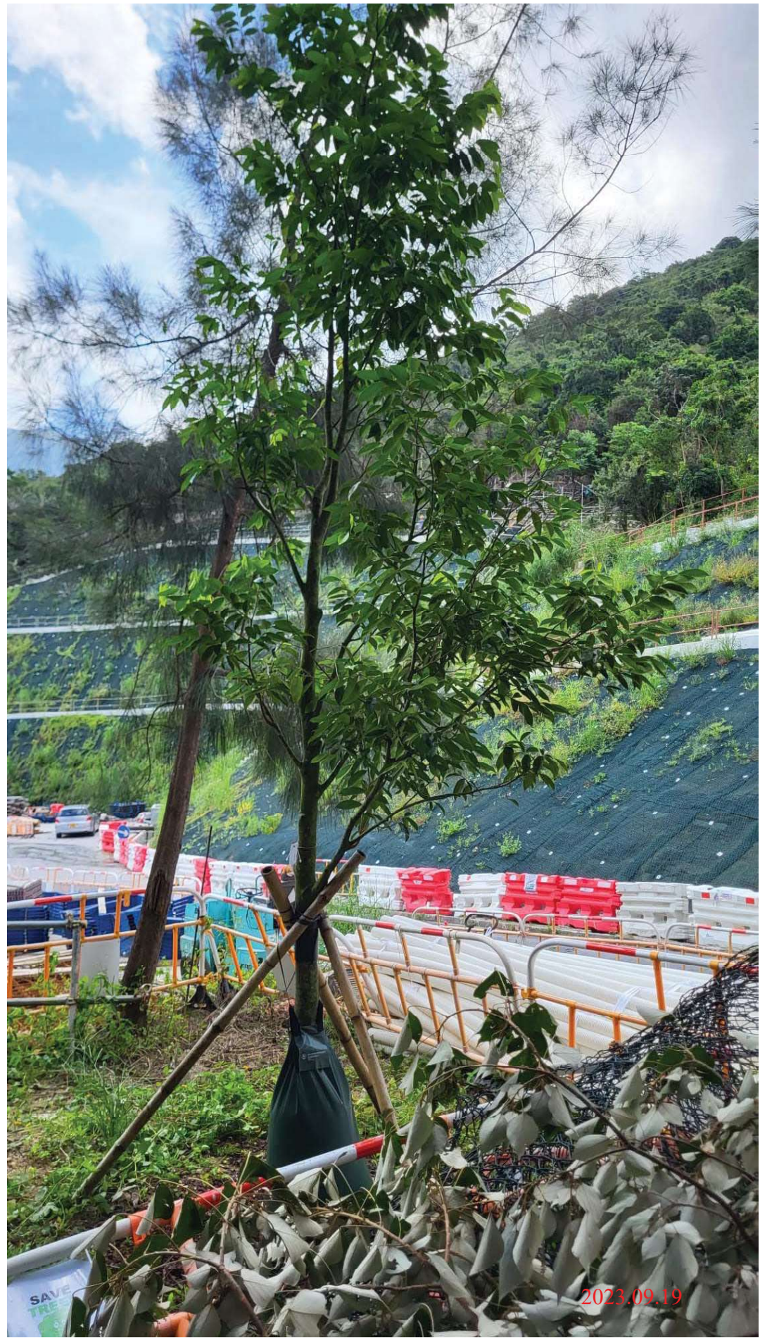
RP01-Whole view of tree